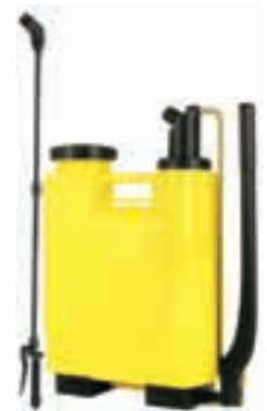
3090 / SBL