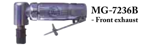
MG-7236B - Front exhaust