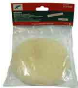
For Angle Grinders