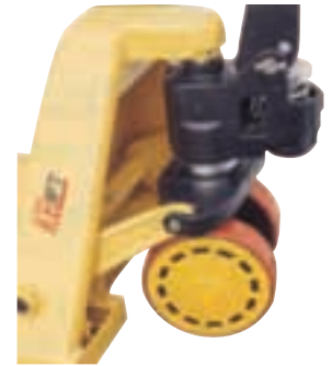
One piece German style pump