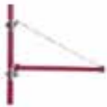
Hoist Frame for PA800A , PA1000A ,