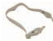
Safety helmet Chin Strap SKU: 210001510