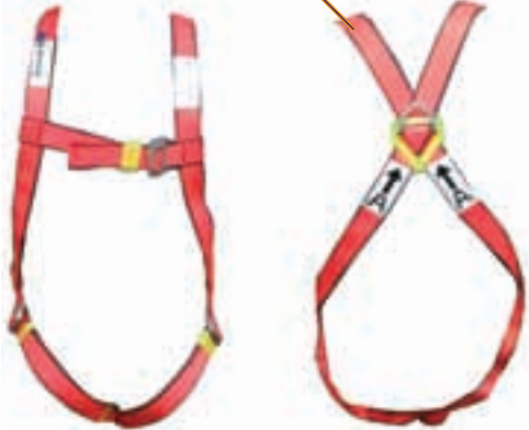
Sky Hawk Fall Arrestor With PSB Mark, SK18